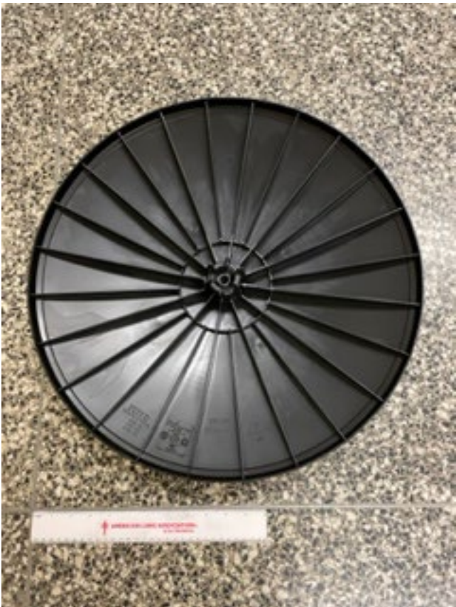
Base, bottom view