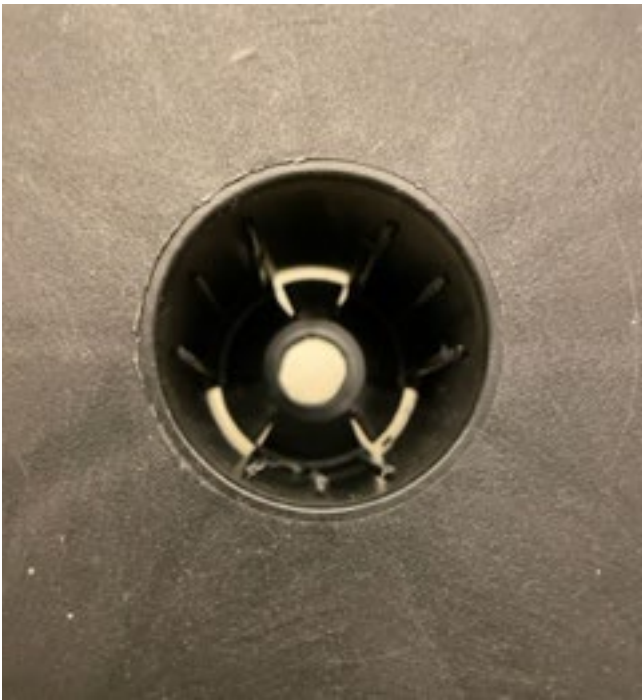
Base, close-up of center: 1-5/8"