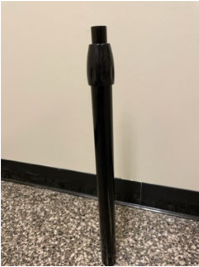
Pole assembly close-up view