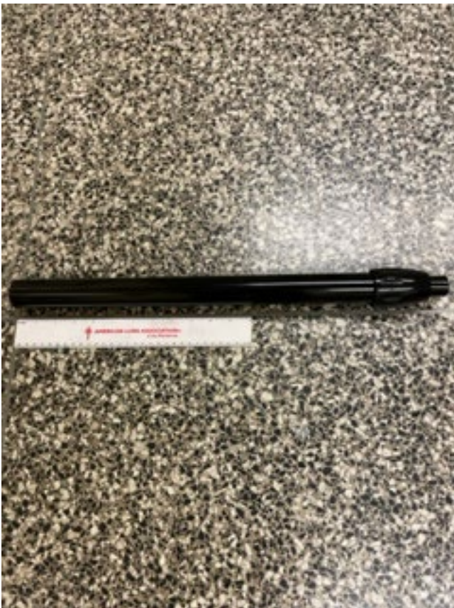
Pole assembly, closed position: 20-13/16"