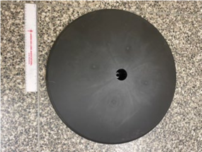
Base, top view: 20-1/8"