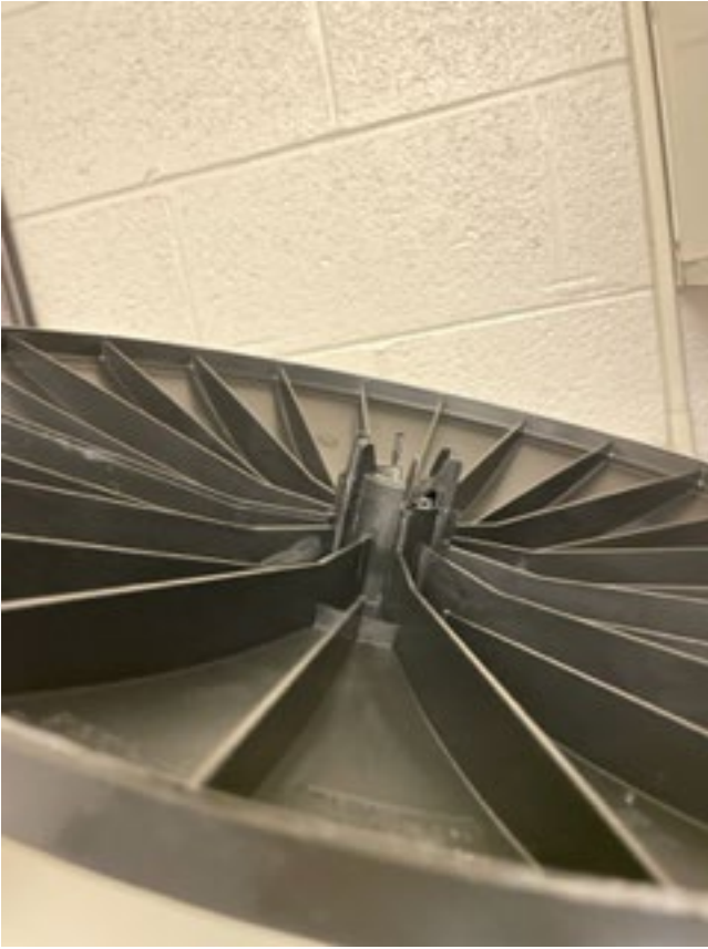
Base, bottom/side view