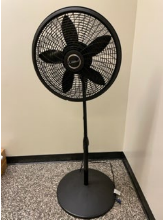
Lasko Pedestal Fan

Pole assembly material: Metal pole with plastic knob