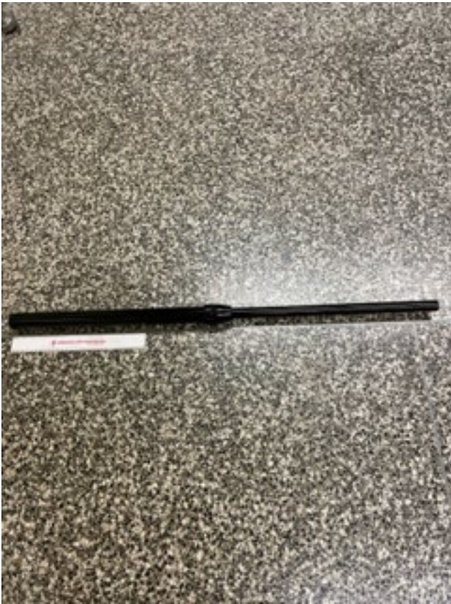
Pole assembly, open position: 37-7/8"