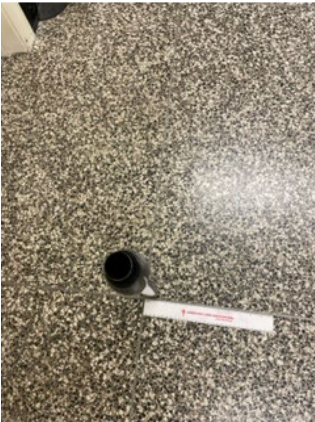
Pole assembly, top view: bottom 1-1/2", top 15/16"