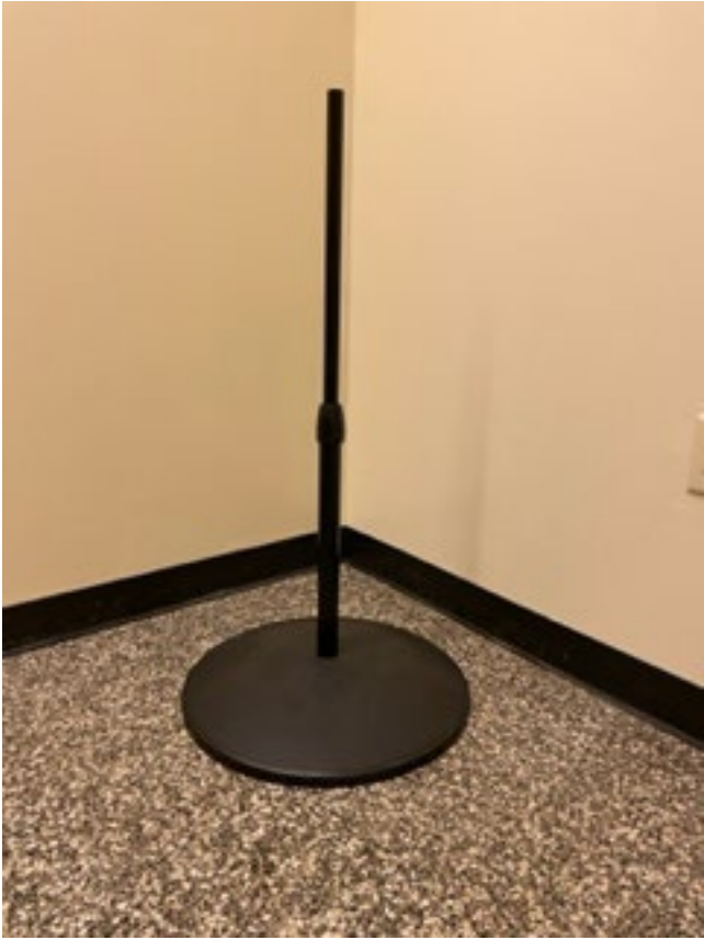
Pole assembly and base: Floor to top of pipe is 38 1/2"