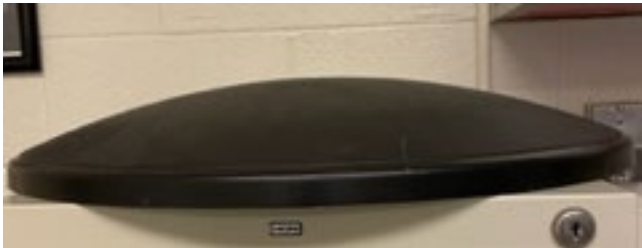
Base, side view: total height 3", straight edge 3/4"