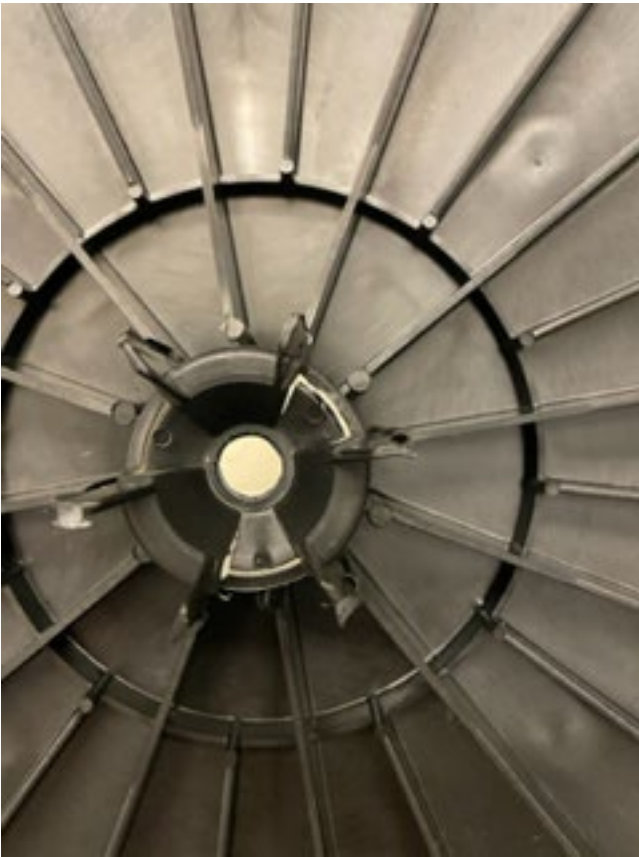
Base, bottom view, close-up of center